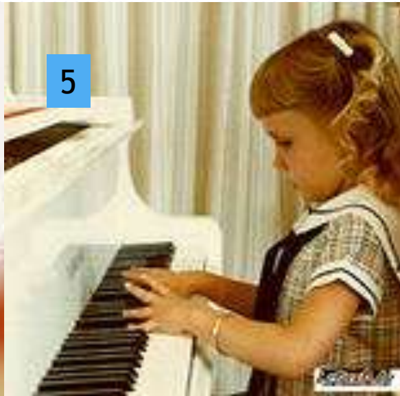
Playing musical instruments